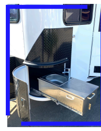
Slide out kitchen Camper only $1,350.00