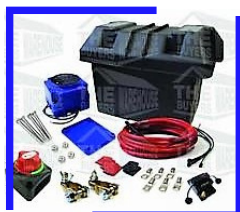
Battery Pack $1,550.00