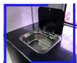
Fold down sink $350.00