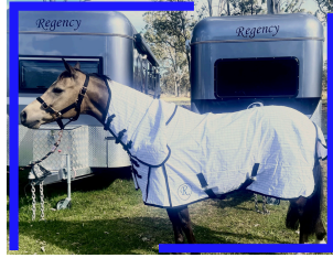
Regency Cotton Combos $65.00