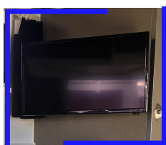
Smart TV $400.0