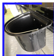
Feed Bin + Bracket $199.00