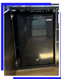
95L 240v/12v Fridge $999.00