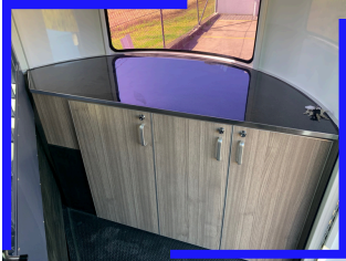
Front storage cupboard (for standard models) $849.00