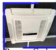
Reverse Cycle Aircon $2,999.00