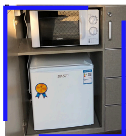
Fridge/Microwave (incl. in campers) $559.00