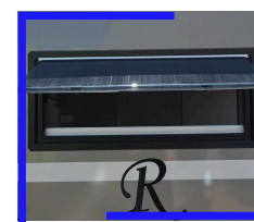
Caravan window Included in Campers $650.00