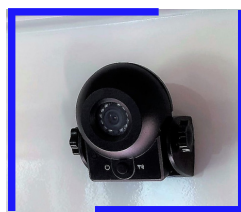
Wireless Camera $350.00