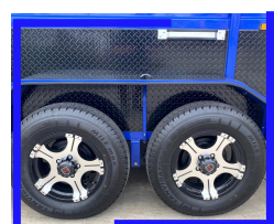
15inch mag/black $650.00