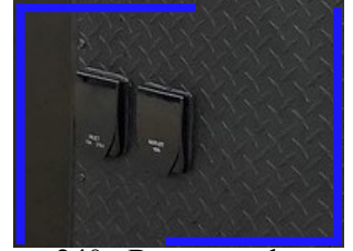
240v Power outlet (inlet incl LUX and camper) $449.00