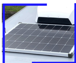
Solar Panel $650.00