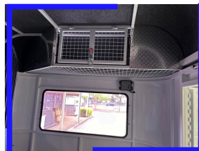
Top rug racks $480.00