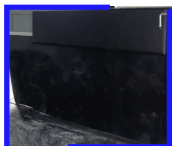
Rubber curtain $225.00