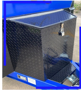
Front tack box $480.00