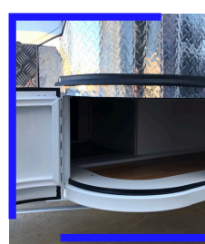
Camper access door $349.00