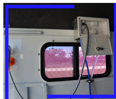
Rear shower $1250.00