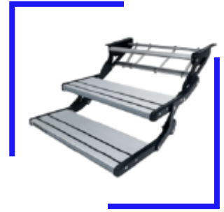
Caravan Steps $390.00