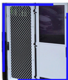
Caravan door (incl. in campers) $999.00