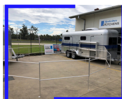
Aluminium Yards $1,250.00