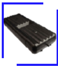
95L water tank upgrade $165.00