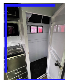
Internal Shower (only in campers) $2,999.00