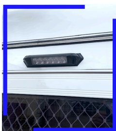
Exterior lights $120 each