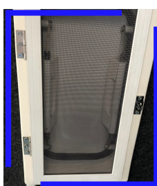
Fly screen on vents $99.00