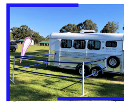
Greystone Yard $850.00