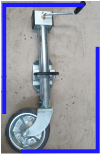
Side handle jockey wheel $125.00