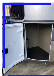
Front access door $449.00