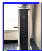
USB Tower $199.00