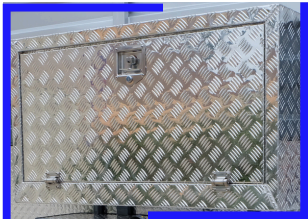
Side tack box $420.00