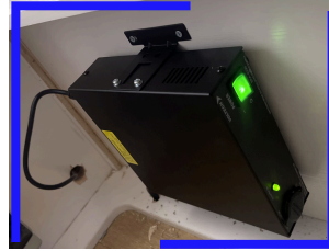
Voltech 240v/12v convertor $480.00